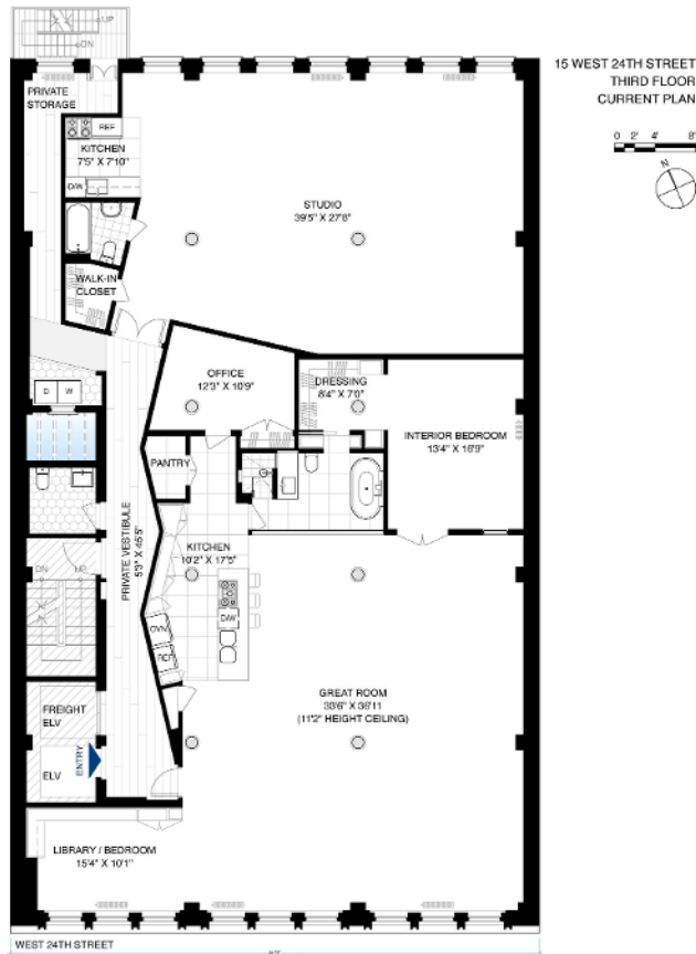
Floor Plan and Financials

11.5' Beamed Ceilings Flexible Plumbing North & South Exposures Private Key-locked Elevator In-unit Laundry 18 double-height windows Communal Rooftop Retreat